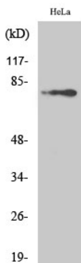
Western Blot analysis of various cells using Phospho-Btk (Y223) Polyclonal Antibody